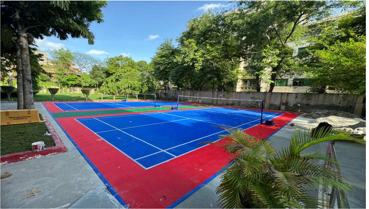
Cricket playing Area with Net (Reference Image)